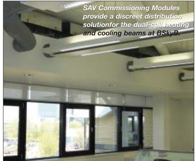
SAV Commissioning Modules provide a discreet distribution solution for the dual-coil heating and cooling beams at BSKyB.

For control purposes each BSKyB building is divided into 7.5 metre zones, each typically being equipped with 3 dual-coil beams linked by Haka flexible multi-layer pipework to a dedicated SAV Commissioning Module. Modulating pumps supply heating and cooling water to the beams via Differential Pressure Control Valves (DPCV's) built in to each SAV Module. This ensures good local